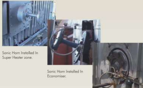
Sonic Horn Installed In Super Heater zone.